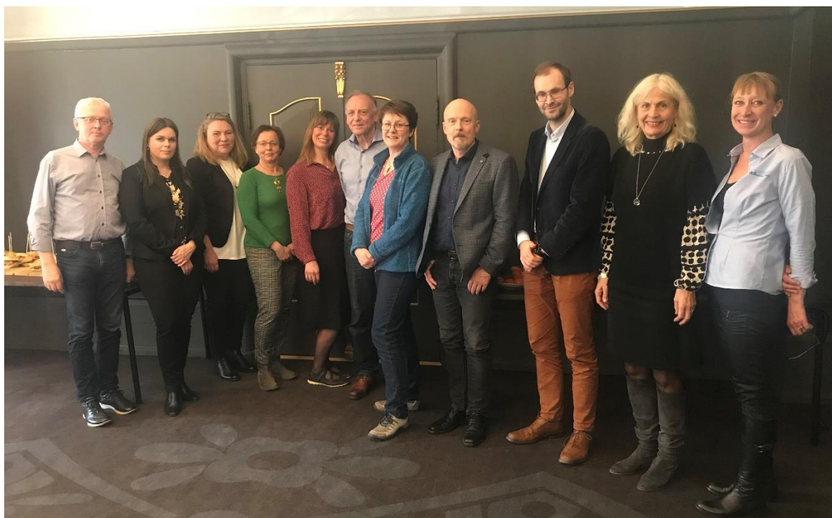
The Executive Board, NFGP secretariat and invited guests.

Let me start at our last NFGP annual meeting in Copenhagen 4 - 5 th of April 2019. The agenda and minutes of the meeting can be found here