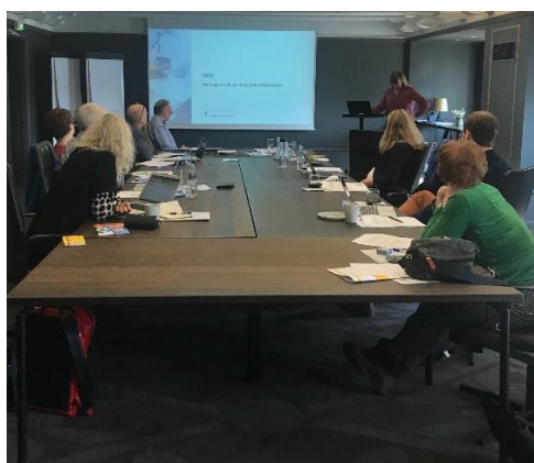
Presentations at the annual meeting