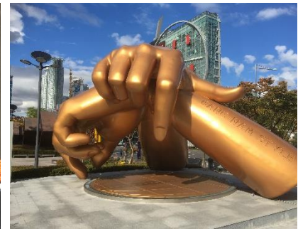
The Gang Nam Style

It was a challenge for us to explore if our Nordic/European values, statements and position papers on overdiagnosis and overtreatment would appeal to our colleagues in a global setting. Therefore, the WONCA World congress in Seoul was a new opportunity. We arranged one oral presentation and one workshop on Overdiagnosis and preventive measures, similar to those introduced earlier in this report. These events were met with enthusiasm and participation from various continents. To many, these concepts were unfamiliar. The concept “Quaternary prevention” awoke curiosity and positive attention from many as it had something to do with prevention. It was my impression that it would be easier to approach these topics by combining them with other concepts, e.g. to address them within the discussion on our core values.